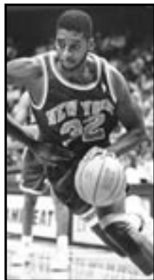
JERROD MUSTAF 1990 • No. 17 overall New York Knicks